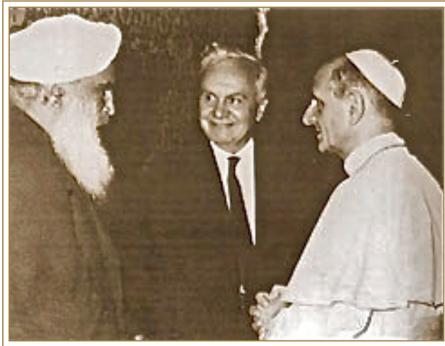
In His function as president of the World Fellowship of Religions Kirpal Singh met Pope Paul VI in 1963.

On His three world tours in 1955, 1963 and 1972 He visited major cities of the Western hemisphere, where He met religious leaders, politicians, and personalities of public life.